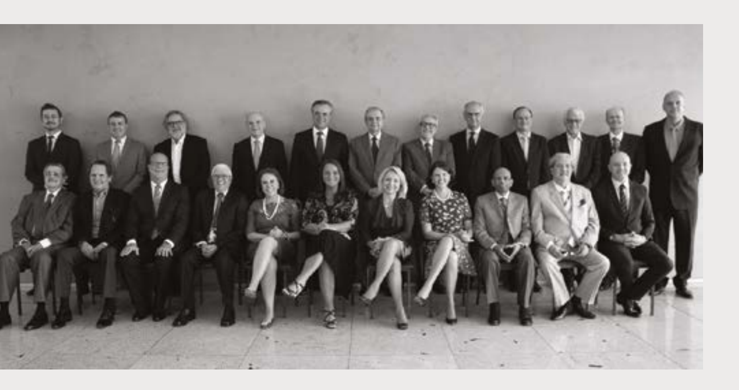
FDC's Board of Trustees meets twice a year to discuss the direction of the institution.

FDC Board of Trustees Annual Meeting also approached the theme of Brumadinho's disaster in order to rethink the relationship between governments, companies and society FADS – During the Board of Trustees' meeting, the members approved the creation of the Fundo de Apoio ao Desenvolvimento da Sociedade (Support Fund for the Development of Society (FADS)). Its purpose is to ensure the continuity of social actions and programs aimed at the simultaneous development of people, organizations and economy, in accordance with the mission, objectives and principles of the institution. The defined focus for social action will be education.