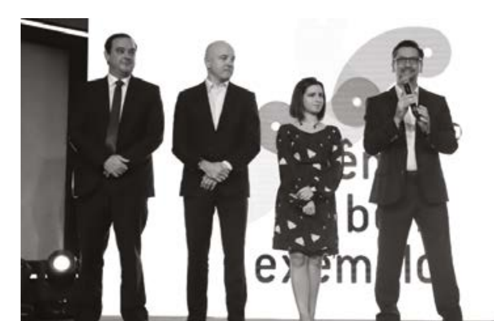
FDC's Executive President participates in the Bom Exemplo Award ceremony in Belo Horizonte.

In 2019, the fourth edition of the Prêmio Bom Exemplo Paraná Award was also held in partnership with RPC, an affiliate of TV Globo in the State. This year, the winning project came from the NGO Vai Cair na Prova, a supportive course, with volunteer teachers, which currently serves 220 students who intend to attend higher education. In 2018, of the 100 NGO students, 54 were accepted into universities, 26 of them at UFPR (Universidade Federal do Paraná).