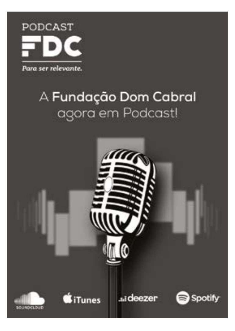
Art specially designed for the internal launch of Podcast FDC.

In our efforts to improve FDC market positioning, we organize and participate in events that are aligned with our objectives and contribute to increased debates on topics that are relevant to both business and society.