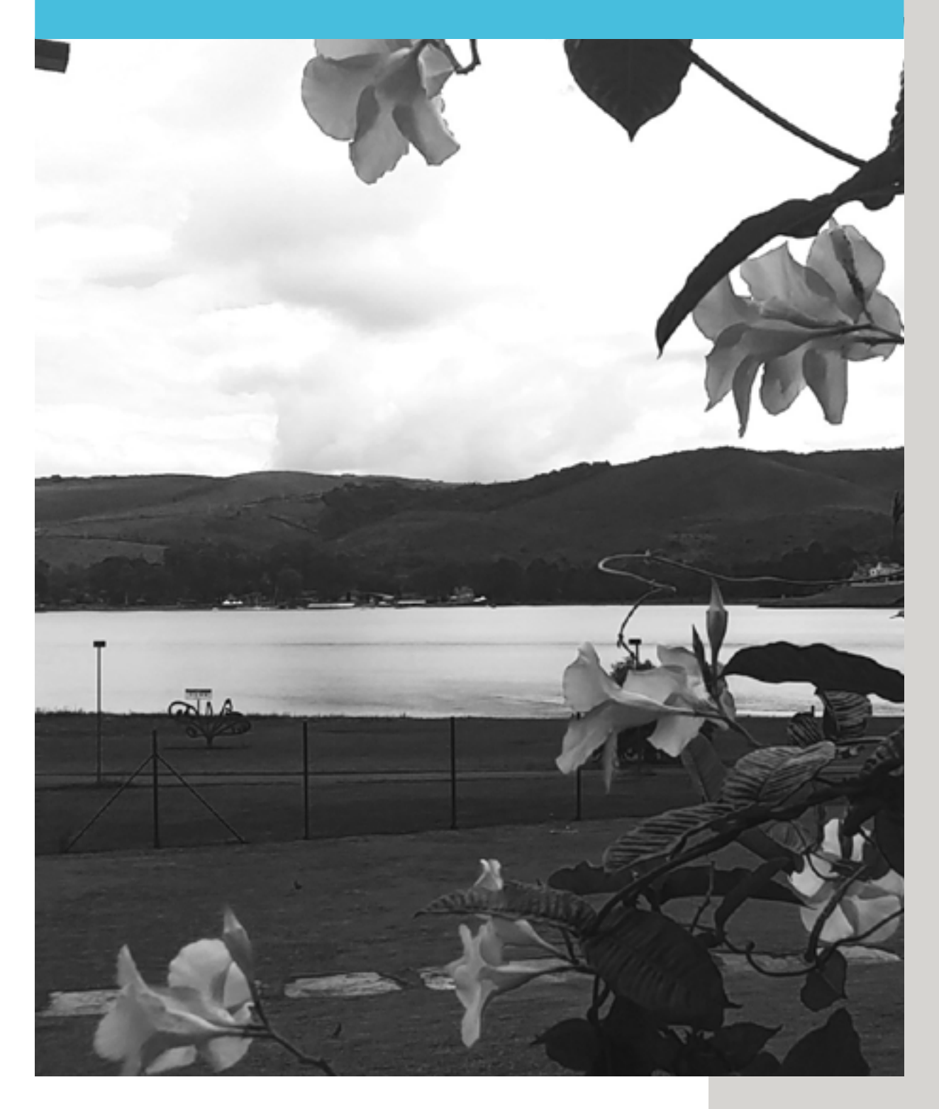
Photo "Flores em um dia Nublado" by Luiza Ribeiro Fagundes, collaborator of FDC, Memória FDC contest.