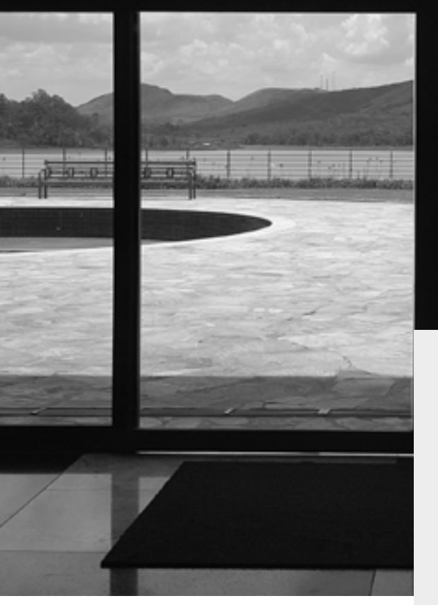
Photo "Porta para o Infinito" by Warney Soares, collaborator of FDC, Memória FDC contest.