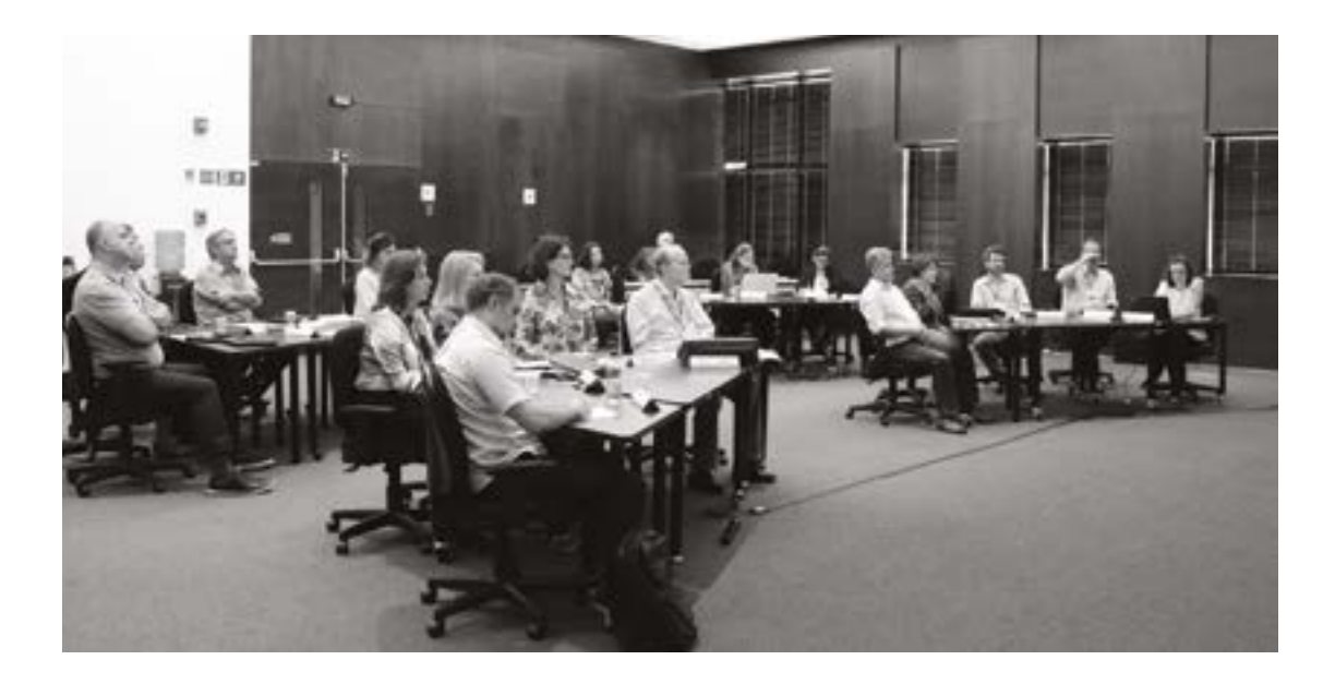
Members of FDC's Ethics Committee hold extended meetings with collaborators and professors.