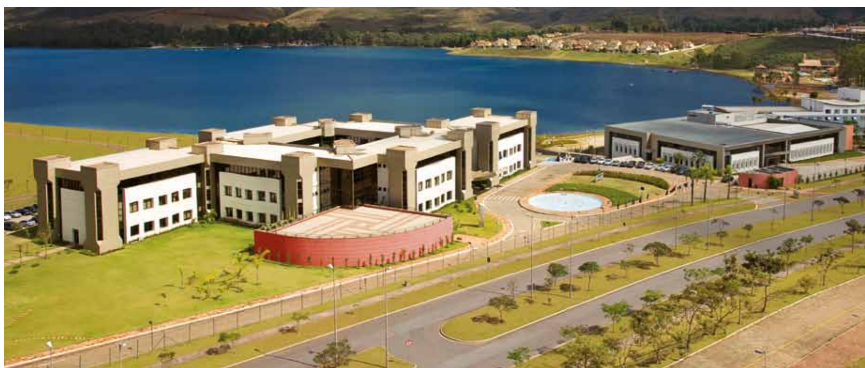
Aloysio Faria Campus

As a result, program participants will take with them reflections produced in the contacts they have had with their classmates and with their professors.