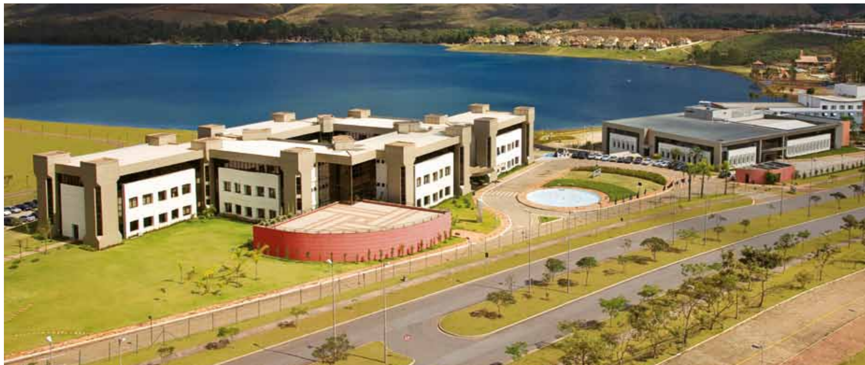
Aloysio Faria Campus

All this high-value-added knowledge generated by FDC is strategically relevant to organizations and to society and can become sustainable and successful businesses for your company.